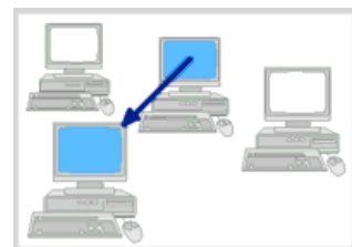
Viewing of student's screen