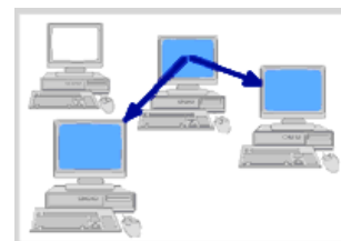
Transmission of student's screen to other students and to instructor